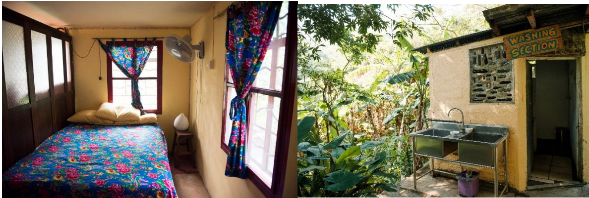
Kitchen and living at Eden Rock